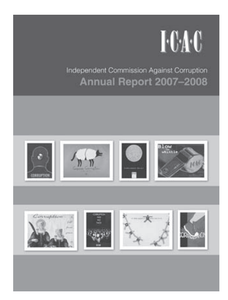
The ICAC Annual Report is available on the ICAC website: www.icac.nsw.gov.au

A major highlight of the Commission's corruption prevention program was hosting the inaugural Australian Public Sector Anti-Corruption Conference in October 2007, which brought together 34 national and international experts to deliver cutting-edge information about anti-corruption work to more than 500 delegates. Other corruption prevention and education highlights in 2007–08 included delivering 57 corruption prevention training sessions, and continuing the regional outreach program with visits to the Hunter and Riverina areas.