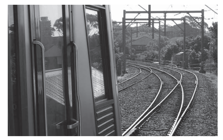
The Operation Monto investigation found widespread corruption in the procurement of goods and services for rail track construction and maintenance, involving both RailCorp employees and contractors.

"The investigation and findings entitle the Commission to infer that the type of corruption exposed extends beyond those individuals identified in this investigation," the report notes. "Therefore the conclusions have applications throughout RailCorp and for other agencies involved in procurement."