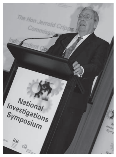
ICAC Commissioner the Hon Jerrold Cripps QC at the Symposium opening session.

Papers and presentations are available for delegates from www.publicminds.org.au