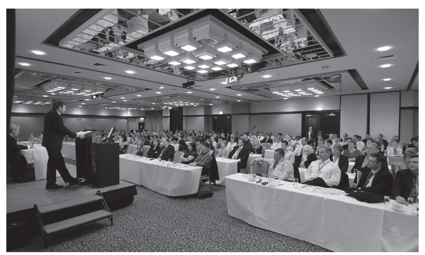
The 7th National Investigations Symposium brought together investigations from around Australia, as well as from Asia and the Pacific.

The 8th National Investigations Symposium will be held in 2010 and planning is already underway.